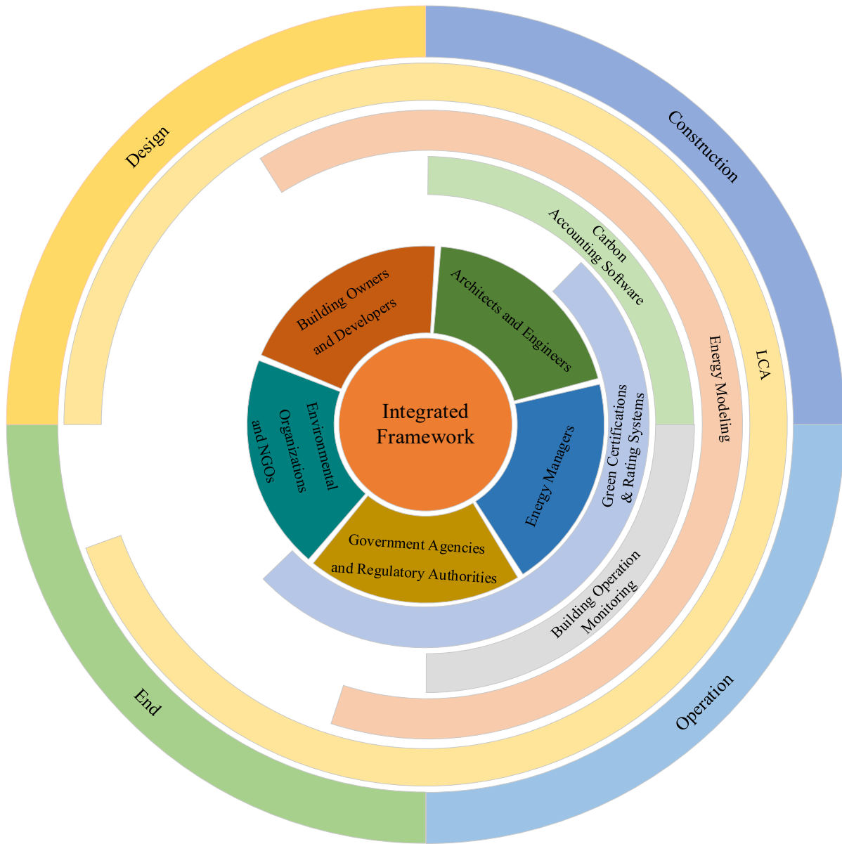
200 Fig. 2: The proposed Carbon Tracking ‘Cabbage’ framework in this paper.

195 engagement approach, the CTC framework fosters collaboration among diverse participants, including architects, engineers, policymakers, and environmental experts, creating a synergistic effort to address carbon emissions and advance sustainability within the construction industry. With integrated carbon tracking technologies and evidenced-based multi-stakeholder practices, the construction industry can play an active role in contributing to the global response to climate change and co-creating a more sustainable and green future.